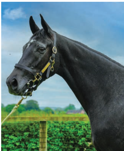
Vroum Vroum Mag's Niece by No Risk At All