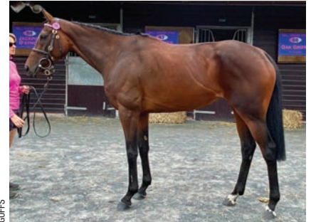
July Flower at the Summer Sale 2024