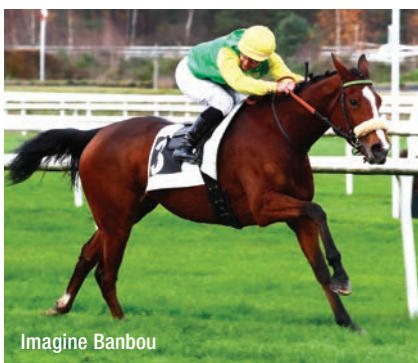
Imagine Banbou

Third in the Prix Jacques de Vienne, Lili Ball (Nom de D'La) won the 2900 m Prix des