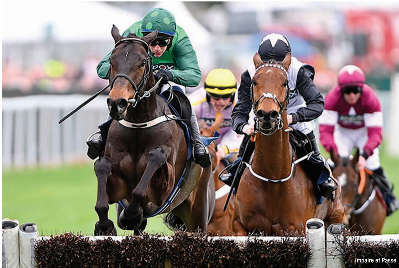
Impaire et Passe

Impaire et Passe (Diamond Boy) won his first Gr.1 over fences in the Faugheen Novice Chase at Limerick on 28 th December 2024, and at the time of writing, he is unbeaten in two steeplechase outings. Willie Mullins's charge,