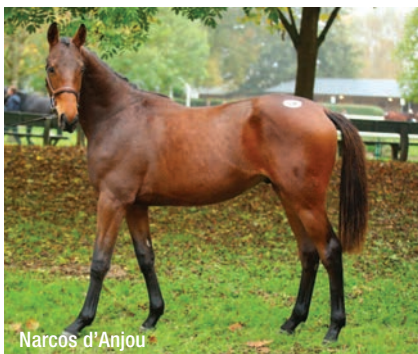
OSARUS Narcos d'Anjou