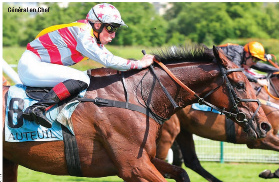
Général en Chef