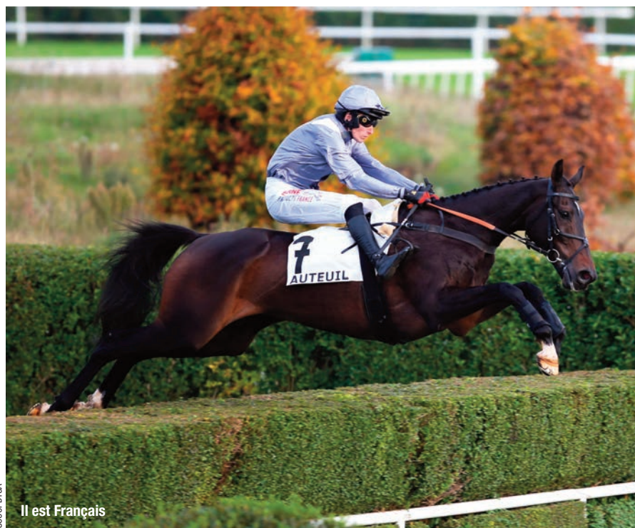
Il est Français

On his autumn return, Il est Français (Karaktar) ran out a brilliant winner of the Gr.3 Prix Richard et Robert Hennessy for