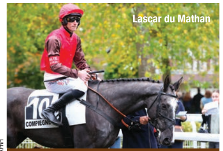
Lascar du Mathan