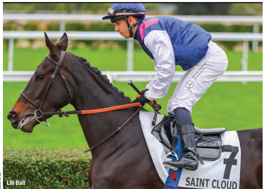
SCOOPDYGA Lili Ball