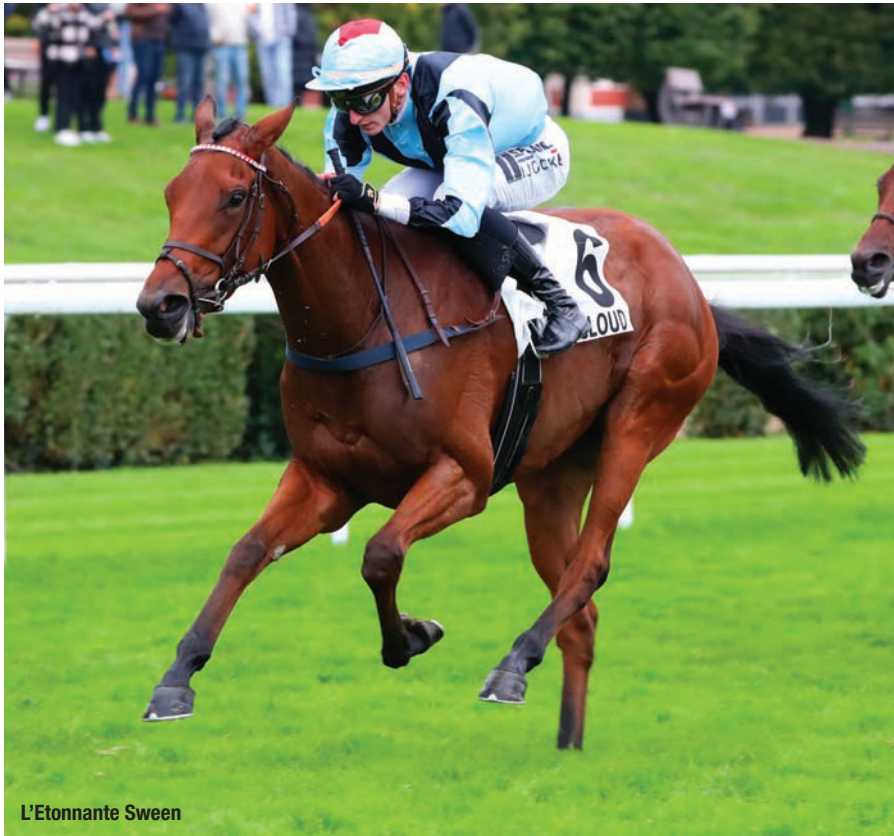
APRH L'Etonnante Sween