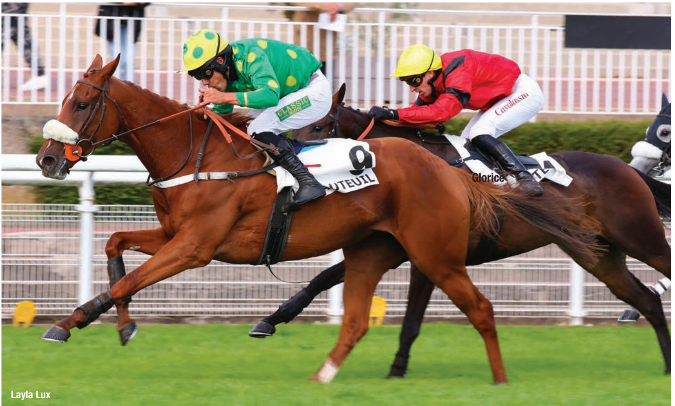
Layla Lux