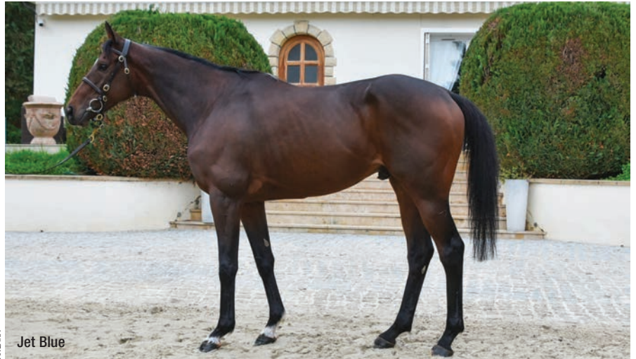
ARGANA Jet Blue