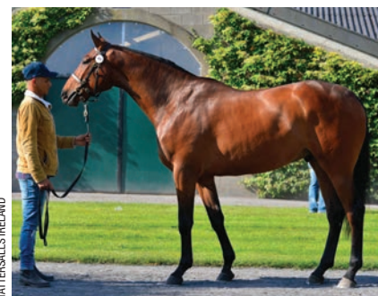
Jakar du Moulin at 2 year